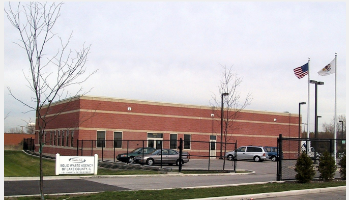
SWALCO Office and HCW Facility in Gurnee, Illinois