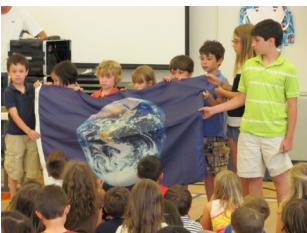
Above: Students from Lake Bluff Elementary School unfurl their new Earth Flag. Below: Recyclers from Beach Elementary School doing their part!