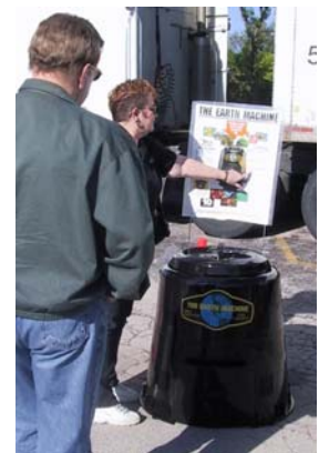
SWALCO subsidizes the cost of household compost bins for Lake County residents, so they can purchase them at a reduced price and compost food scraps and yard waste at home.

and the original gas station pilot participants. In 2008 the Village of Vernon Hills initiated a beverage container recycling program at its Athletic Complex. With Agency assistance 20 “Pop Bottle” collection bins were placed adjacent to existing waste collection containers throughout the Athletic Complex.