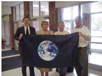
Administration and Educators from Grayslake North High School holding their Earth Flag, presented to them after their year-long efforts and achievements fulfilling the criteria for the SWALCO Program.