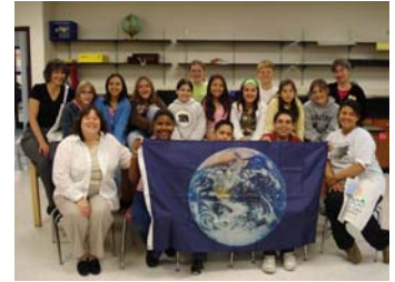
SWALCO's Earth Flag Program educates students, teachers, parents and administration about the impact that waste reduction, reuse, recycling and buying recycled has on the environment.