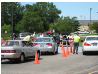
Residents from Lake County are assisted by Island Lake Public Works and SWALCO staff as they drop-off their HCW at a Mobile Collection Event.

Additionally, ten (10) public drop-off events were conducted. Participant surveys indicate approximately 43% of the participants were first time visitors to the events. Approximately 7,020 households were served collecting approximately 650,000 pounds of waste.