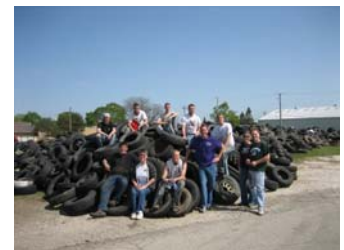
SWALCO & Farm Bureau staff and volunteers collected over 13,000 tires and 1,850 gallons of used oil at a special recycling event.

In 2007/2008 approx. 1.2 million pounds of hazardous waste was collected that otherwise would have gone into the landfills or sanitary systems.