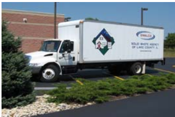
Mobile HCW events are held at locations around Lake County. Year-round collections at the Gurnee facility.