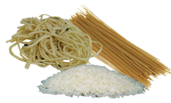
Pasta & Rice