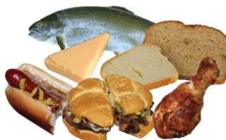
Meat, Fish, Dairy & Bread