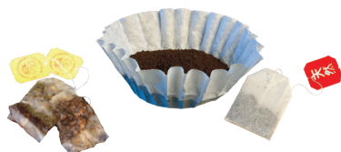
Coffee Grounds & Filters & Tea Bags