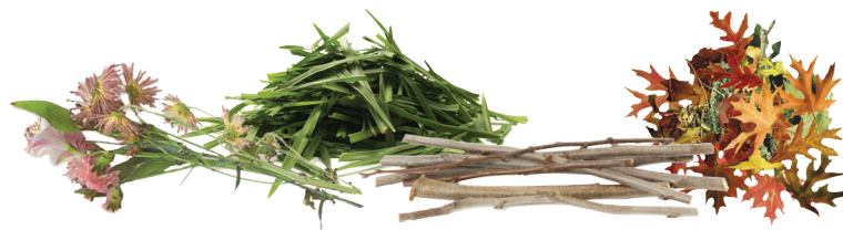
Plants & Trimmings, Flowers, Leaves, Grass, Branches, House Plants & Weeds