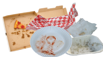
Uncoated Paper Plates, Napkins & Pizza Boxes