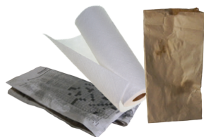
Paper Bags, Paper Towels, Newspaper & BPI Compostable Bags