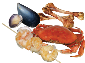
Shells & Bones